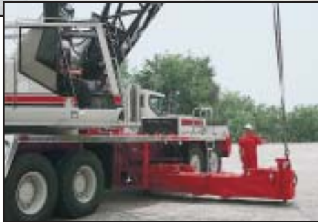
The front outrigger box can be easily removed for transport in locations with severe weight restrictions.