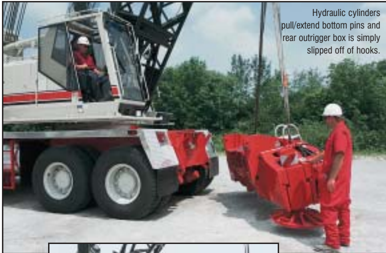
Hydraulic cylinders pull/extend bottom pins and rear outrigger box is simply slipped off of hooks.

The HC-238H II and HC-248H are designed to be self-erecting and self-stripping. The optional 10' extension with lifting sheaves is used to assemble/disassemble, or the live mast can be used as a short boom for loading and handling counterweight, outrigger boxes and boom sections — eliminating the need for a helper crane.