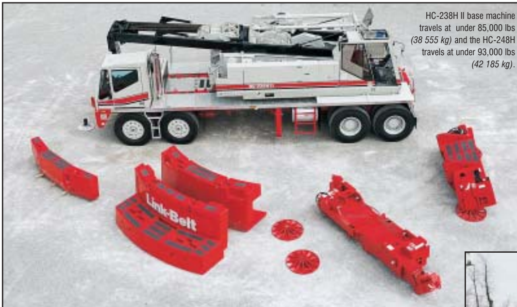
HC-238H II base machine travels at under 85,000 lbs (38 555 kg) and the HC-248H travels at under 93,000 lbs (42 185 kg).